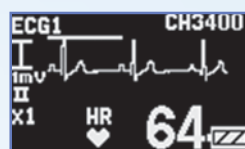
When the ECG is displayed

It makes it easier to check pre-inspection information such as the waveform, lead condition, remaining battery level, transmission channel and so on, once electrodes are attached.